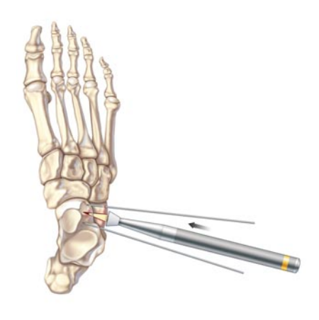
Final graft position can be manipulated by gently tamping the graft