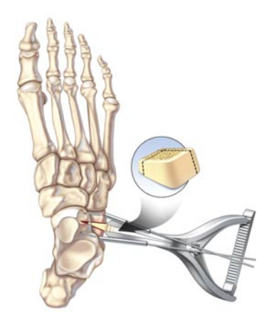
Reconstitute the graft Utilizing distractor, implant pre-shaped wedge Note: Graft length and width may be modified for improved fit