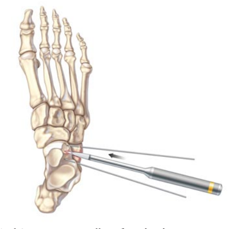
Trial Sizers represent allograft wedge dimensions