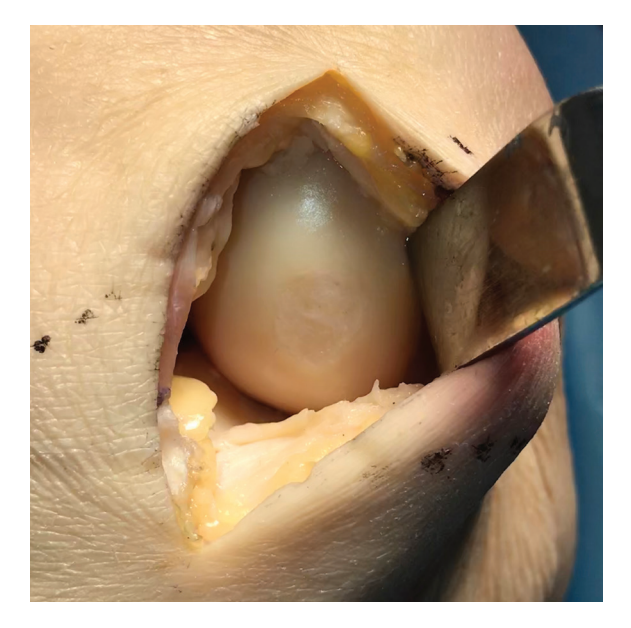
Figure 1. CartiMax putty implanted in a MFC defect (pre-cycling)

A cadaver knee was used for this mechanical testing study. Two types of chondral defects were examined and created using a mini-open surgical technique. First, a defect was created in the medial femoral condyle (MFC) and was approximately 12mm in diameter. CartiMax putty was prepared as per the package insert and the defect was filled so that it was flush with the adjacent cartilage (Figure 1). Fibrin glue was not used in this testing. The knee was then closed and was subjected to 500 cycles of 10–90° flexion-extension motion. At the end of the 500 cycles, the knee was cycled an additional five times under a manually applied load. Following cycling, the knee was opened up to evaluate the CartiMax sample (Figure 2).