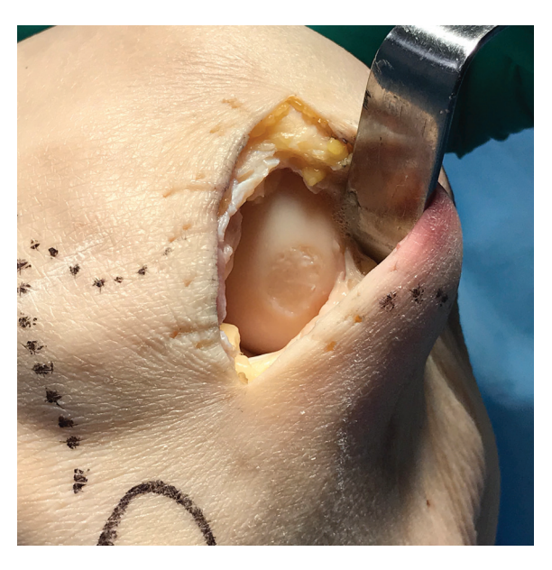
Figure 2. CartiMax putty in a MFC defect (post-cycling)