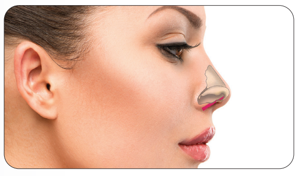
Figure 1: COLUMELLAR STRUT

Profile's pre-cut form requires little intraoperative manipulation for use as a columellar strut (Figure 1), spreader grafts or dorsal on-lay graft. Surgeons commonly use one or more of these grafts in rhinoplasty procedures.