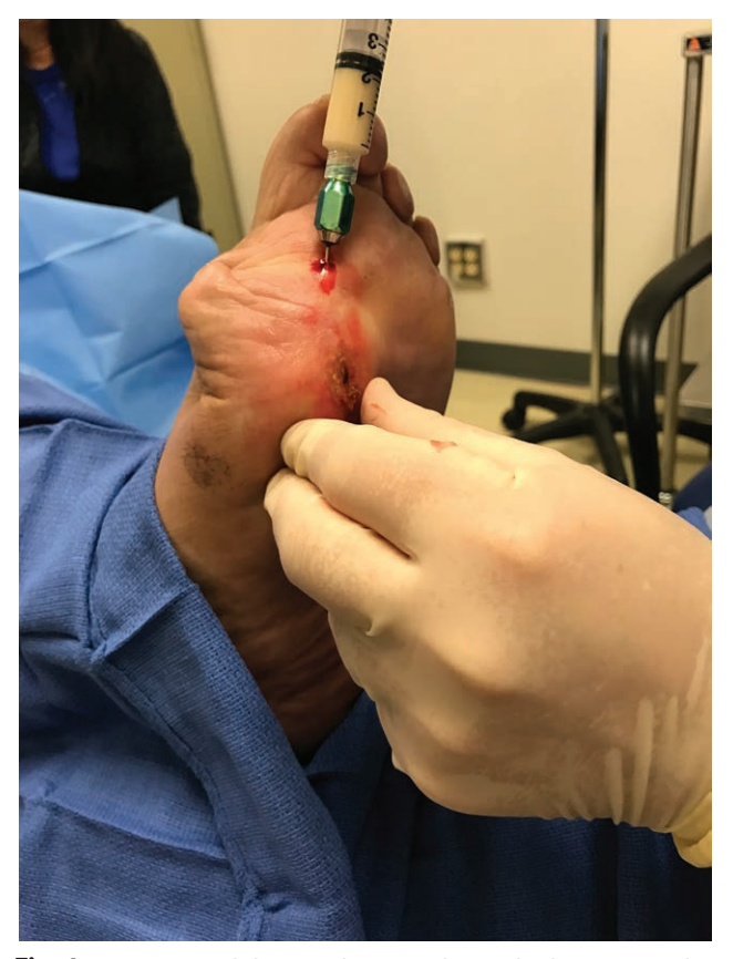
Fig. 1. Fat is injected deep to the wound in multiple passes and in multiple depths with microdroplet deposition technique.

and tolerability in healthy volunteers in a phase I prospective study. ^{\rm 20}