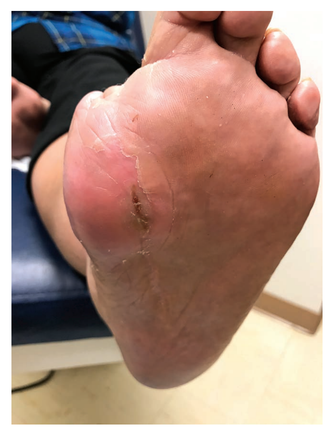
Fig. 4. Four weeks following grafting demonstrating resolution of preulcerative callus.