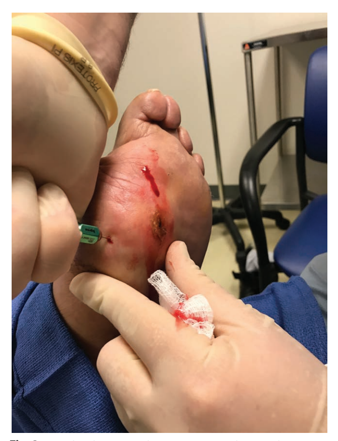
Fig. 2. Cross hatching is used to promote vascularity and ensure no large puddles form.

To determine the location of peak pressure, the F-Scan in shoe system (Tekscan Inc. Boston, Mass.) was used.<sup>21–23</sup> The F-scan pressure sensor, fit to size so not to interfere with the patient's pressure mapping, was placed in the pa-