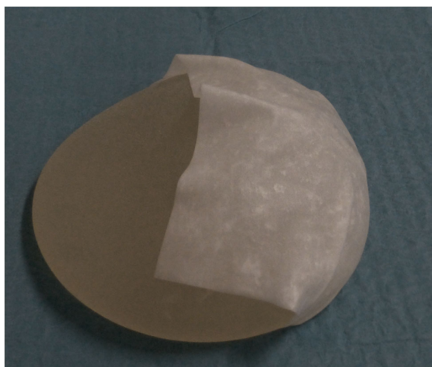
Fig. 2 A photo illustrating placement of Meso BioMatrix® at the lower pole of a breast implant

Women with the following criteria were excluded in the BRIOS study as well in the Meso Biomatrix® group: a body mass index >30 \text{ kg/m}^2 ; preferring a breast size larger than cup C; receiving a polyurethane implant; pregnant women; on-going severe psychiatric illness or mental retardation; evidence of alcohol and/or drug abuse;