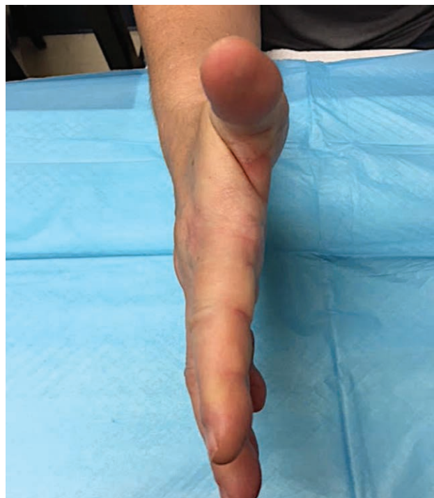
Fig. 3. Postoperative view of patient showing improved range of motion (ROM).